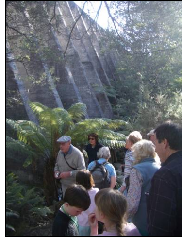
Mt Paris Dam.