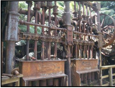
Anchor Tin Mine stampers.