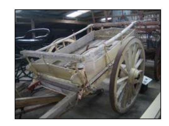
Some of the horse-drawn vehicles on display.