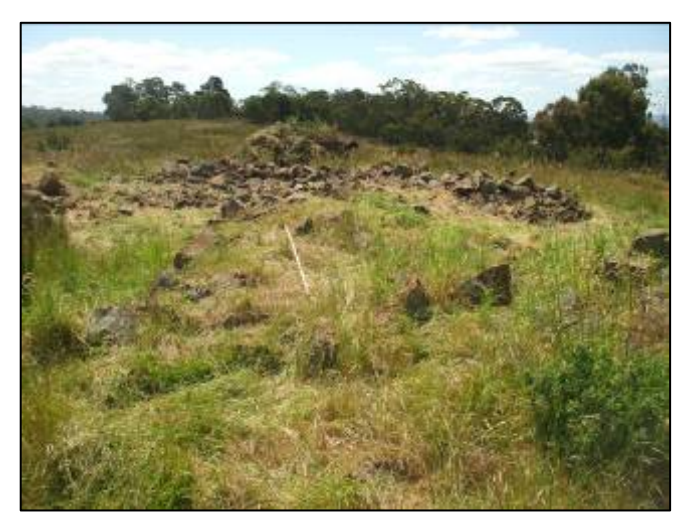
Stone foundations of probation station revealed.