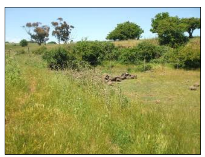
Quarry site at Kerry Lodge.