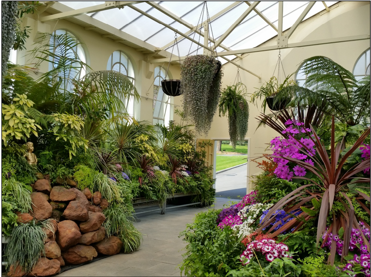
Interior of the John Hart Conservatory.