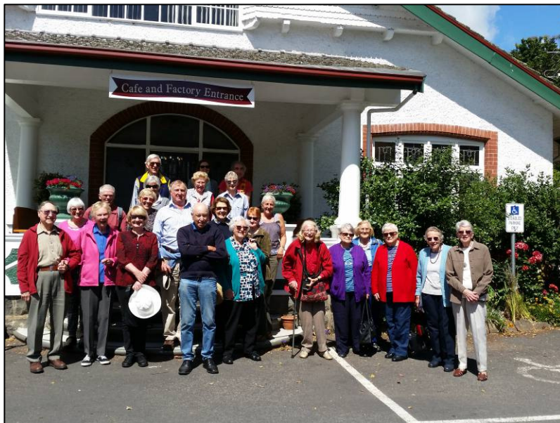
The excursion group outside the House of Anvers, Latrobe.