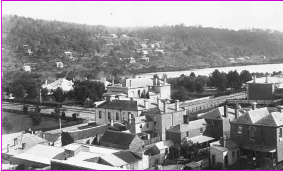
The old Court House with the Depot Gardens behind. Detail of QVM1991-P-1342.