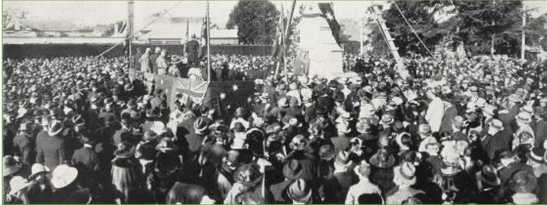
Unveiling of the Cenotaph on Anzac Day 1924. Weekly Courier , 1 May 1924, p. 22.

Just as happened all over Australia in cities and towns, the people of Launceston wanted a memorial to commemorate those who had died in World War 1. Immediately after 1918, services of commemoration such as those on ANZAC Day, were held at the Boer War memorial in City Park but in 1921 a war memorial committee was formed to establish a new memorial and determine where it would be. Some people wanted it in Royal Park, some in City Park or Windmill Hill and others near the public buildings and the Post Office in St John St.