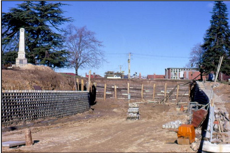
Bathurst Street extension through Royal Park 1973.

In 1968 the Singaporean company P G Pak-Poy completed the Launceston Area Transportation Study. One of their recommendations was to create a northern city outlet by extending Bathurst Street under Paterson Street and through Royal Park.