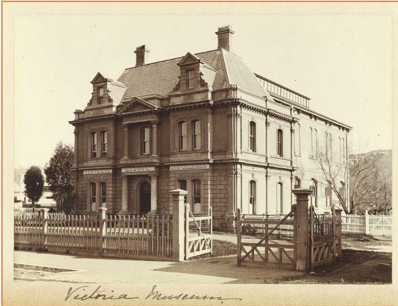
Victoria Museum, c.1891.

The 1880s was a time of enormous municipal development in Launceston – the Post Office, Town Hall and the Albert Hall all were built around this time.