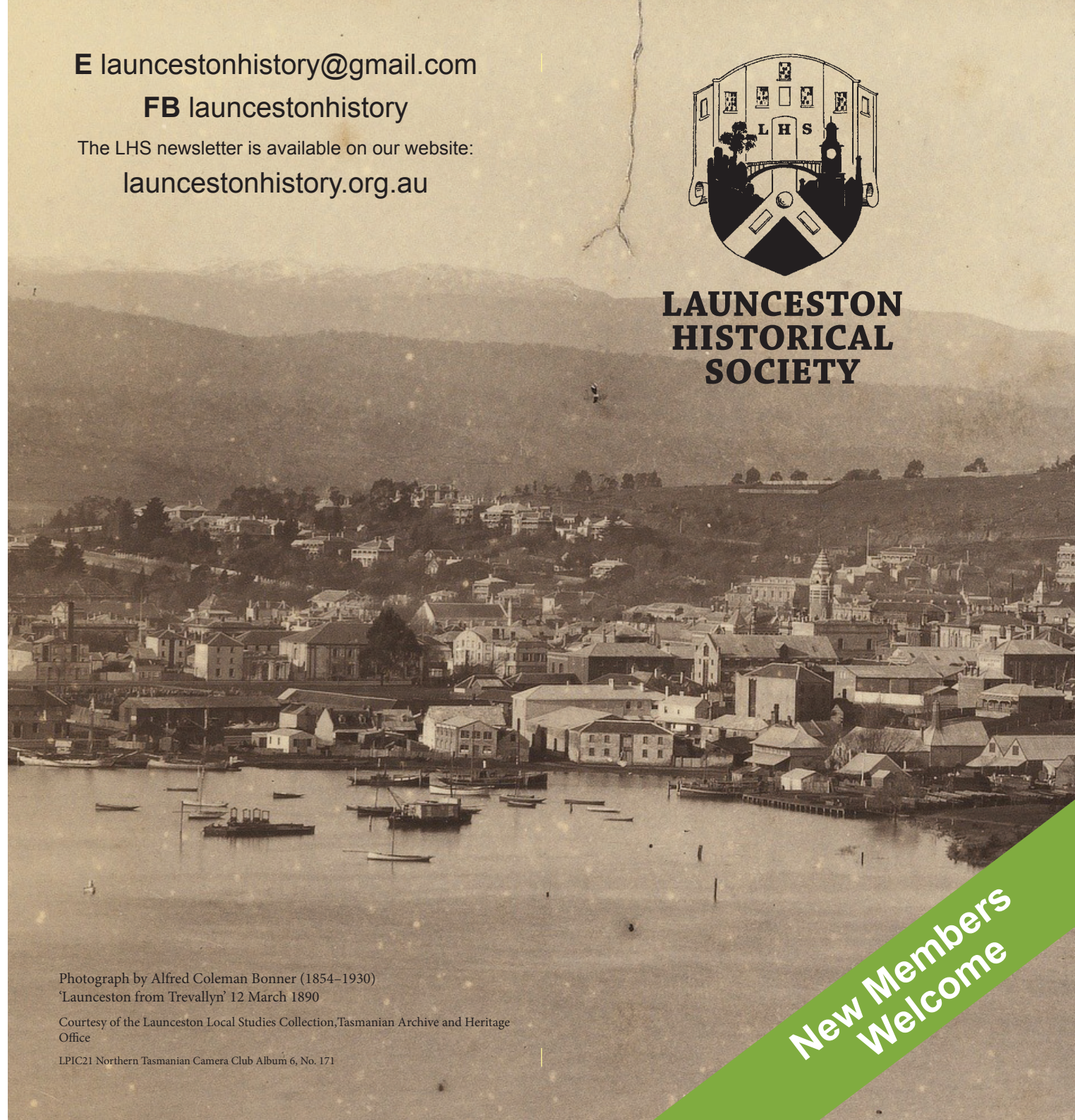
'Launceston from Trevallyn' 12 March 1890