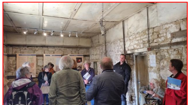
Inside the restored Commissariat Store.