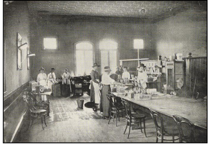
Albert Hall relief kitchen. WC 18 Sep 1919