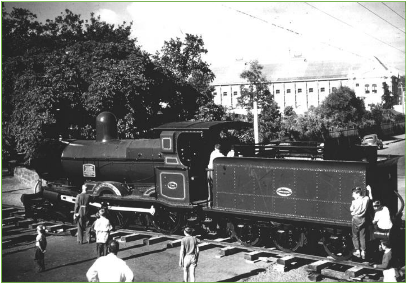
A4 locomotive being moved to City Park in 1960.

Rowan Kinnane from southern Tasmania is planning several videos to celebrate the 150th anniversary of Tasmanian Railways. One of them will be a feature on the A class steam locomotive that used to be in Launceston's City Park before it moved to the Don River Railway in 1990. Do any members have photos, or even film footage, of the steam loco when it was displayed in the park that they are happy to share with Rowan? Any material used will be acknowledged.