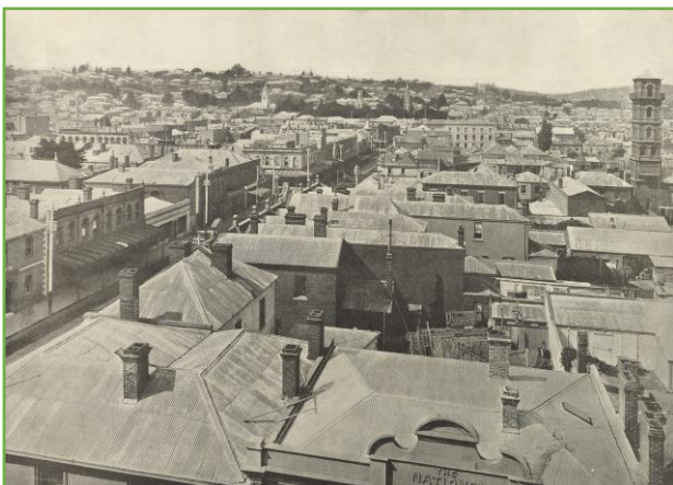
Launceston view

Sunday 19 November 2023 – 2pm, Meeting Room, Queen Victoria Museum, Inveresk