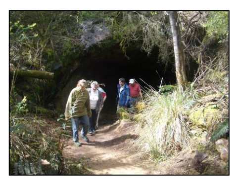
Derby Mine tunnel entrance.