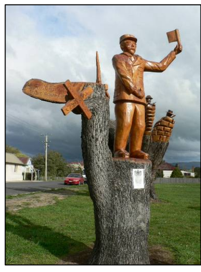
Legerwood carving.