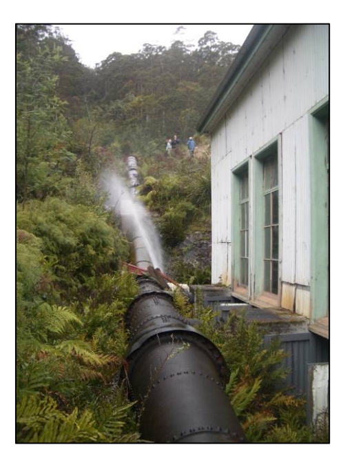
Moorina pipeline leak.