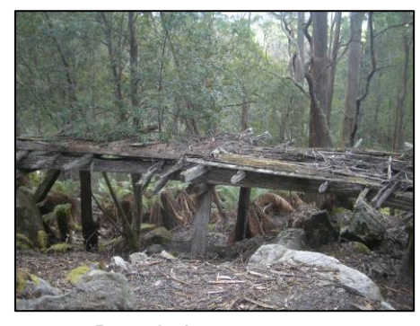
Branxholm water race.