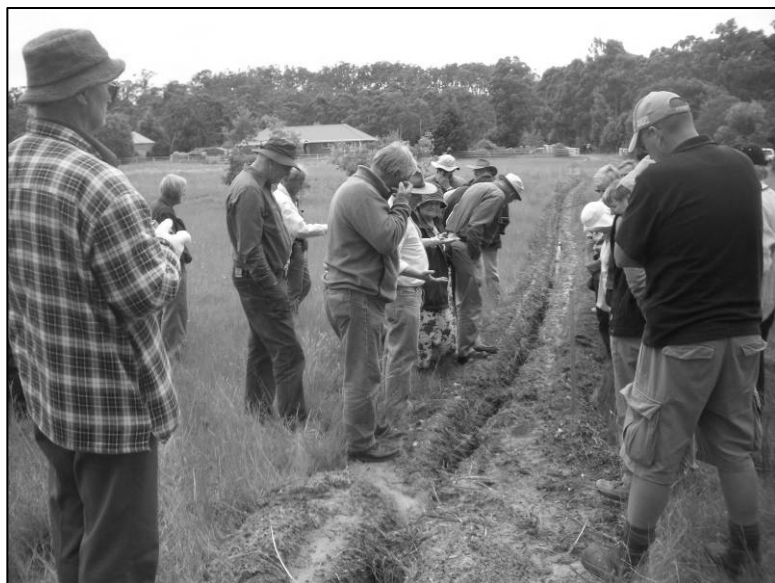
The trench cut through a hut site at York Town.