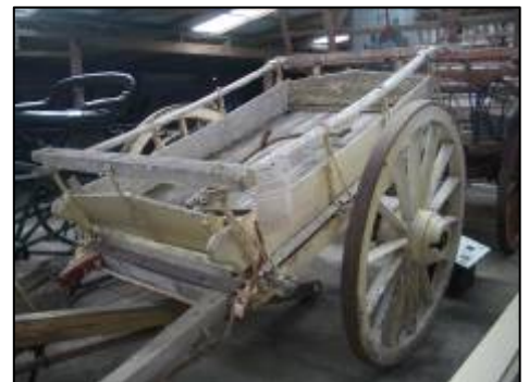
Some of the horse-drawn vehicles on display.