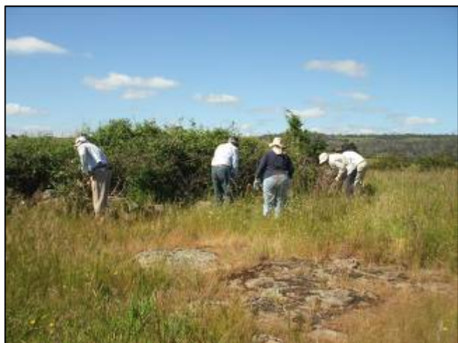
Hard at work clearing weeds from the historic site.

During our visit we discovered the location of the circa 1840s position of the road to Hobart and an