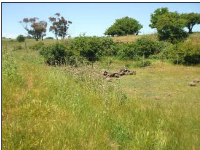
Quarry site at Kerry Lodge.