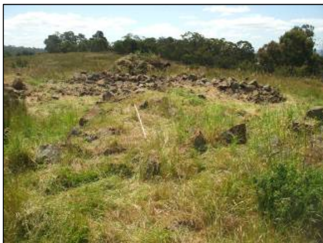
Stone foundations of probation station revealed.