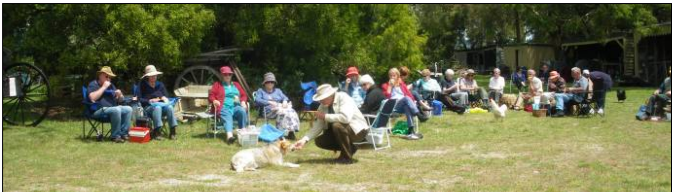
Enjoying lunch at 'Bonny Brae Farm', Clarence Point.