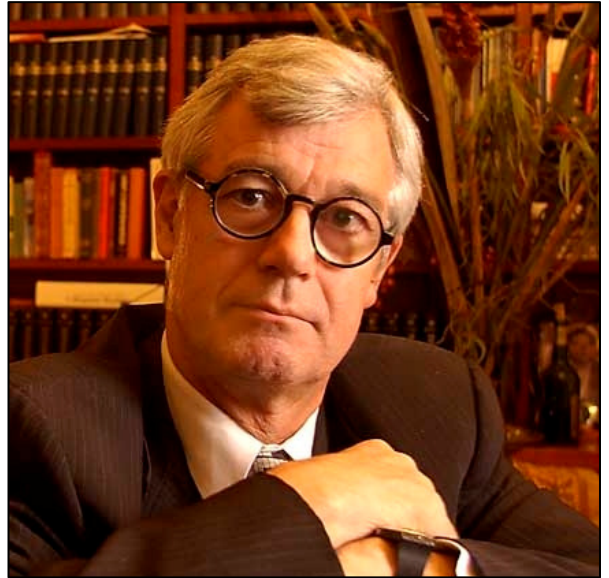
Julian Burnside AO QC.

He is passionately involved in the arts. He collects contemporary paintings and sculptures and regularly commissions music. He is Chair of Fortyfive Downstairs, a not for profit arts and performance venue in Flinders Lane, Melbourne, and Chair of Chamber Music Australia.