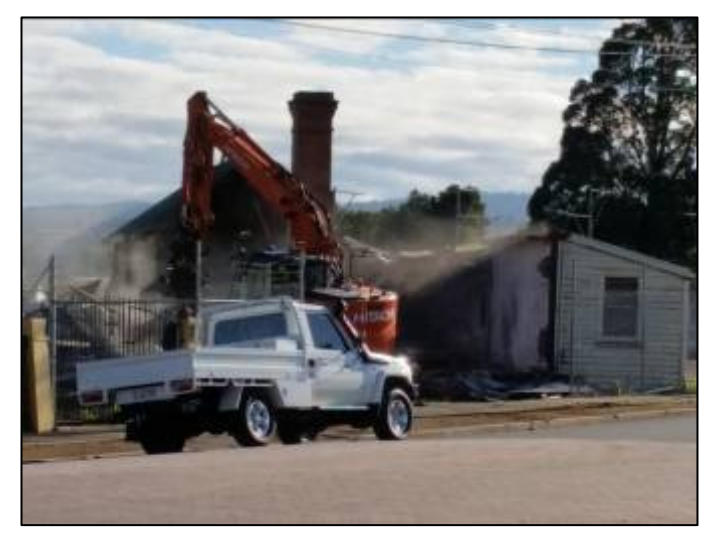
The old caretaker's residence at the Cypress Street Cemetery (Broadland Park) was demolished on 18 September 2015