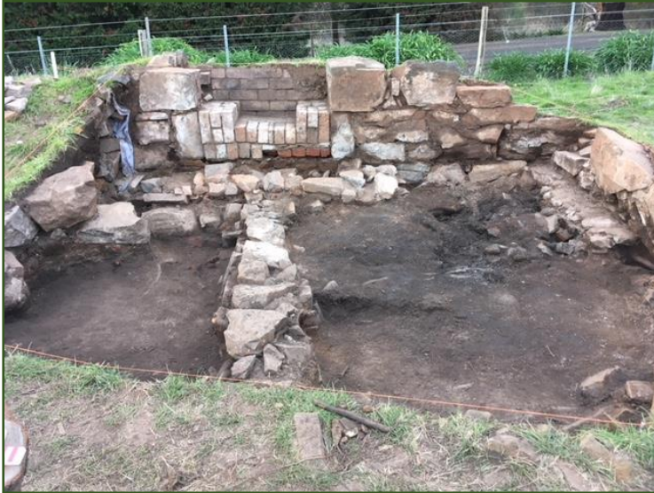
The cottage being excavated at Kerry Lodge.

The excavation part of the dig at Kerry Lodge was a great success. A total of eight trenches were dug. Two trenches over the location of the 1830s Hobart Road failed to find it, and three trenches over the location of the timber convict accommodation failed to find its location. The kitchen trench was supervised by LHS member Angie McGowan and she discovered much more about the building of the kitchen and the various phases of the building. In the last couple of days of the dig, in the earliest under floor deposits, a most unexpected find occurred. The discovery was revealed at the lecture on 13 May ... it was exciting! (see below)