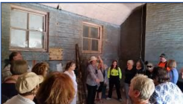
Inside Willow Court at New Norfolk.