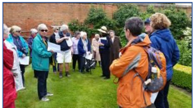
Touring the garden at Strathmore, Nile.

We held two fabulous excursions in 2018. The first was an overnight trip to New Norfolk in February. Some of our group had the opportunity to take part in an archaeological dig behind Frescati House. We all explored the sadly abandoned buildings of the Asylum complex – some older than Port Arthur and just as important in a historical context.