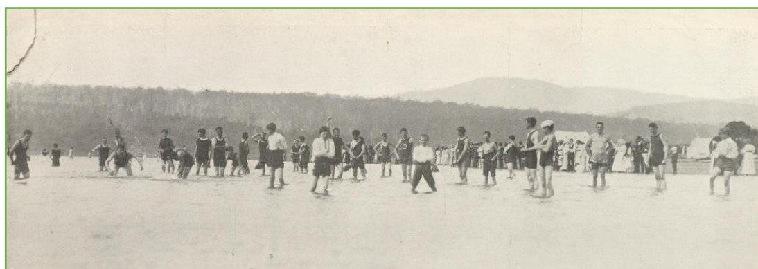
In the water at Swan Point. Weekly Courier , 12 March 1914, page 20.