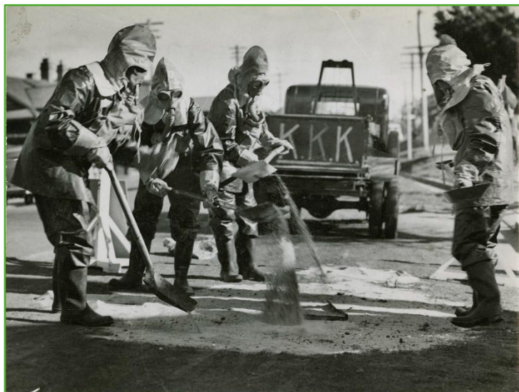
Decontamination workers busy in East Launceston area. The Examiner , 26 August 1940 p.1 and LPIC 147-7-208

Sunday 16 August 2026 – 2pm Meeting Room, Queen Victoria Museum, Inveresk